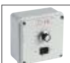
Ceiling Fan Controller